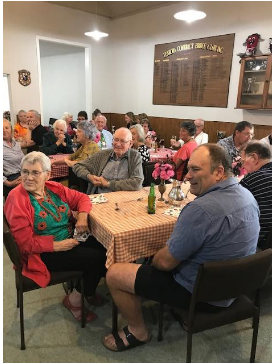
the food and the “phantom waitress” a room full of wine and dined players